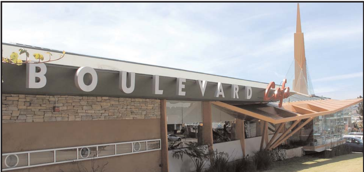
Post-tour we'll meet for happy hour in the lounge of the Modernist-style Boulevard Cafe.

Directions to the Doelger Center: South on Interstate 280: take John Daly Boulevard exit; turn right on John Daly and continue west and turn right at Lake Merced Boulevard, turn right down driveway at Westlake Park sign to the Doelger Center. North on Interstate 280: take John Daly Boulevard exit; continue along Freeway frontage to John Daly Boulevard and turn left. Continue west and turn right at Lake Merced Boulevard. From Lake Merced Boulevard turn right down driveway at Westlake Park sign to the Doelger Center.