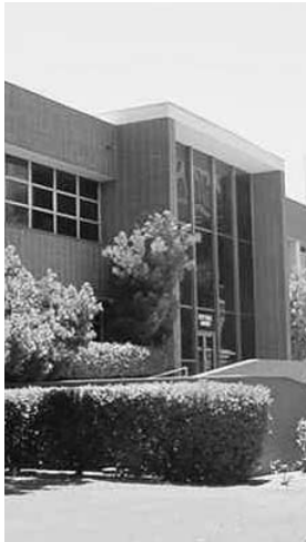
Top: The H.H. Brix Mansion.