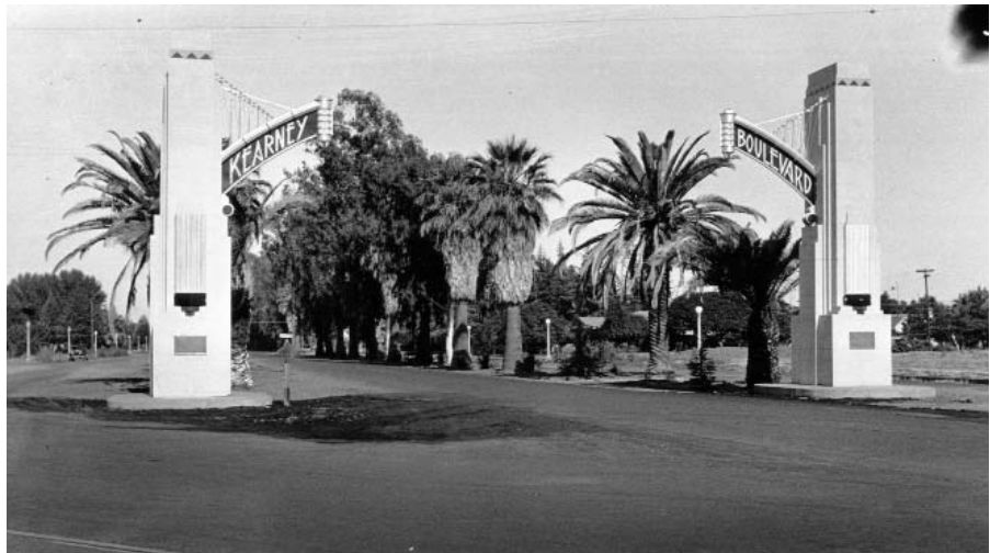
Kearney Blvd. Gateway (Charles H. Franklin, 1933; Designed by Rudolph Ulrich.

Fresno , a city of 500,000, is the market center for the richest agricultural county in the United States. The area has a distinct historic and cultural landscape, a vestige of the agricultural colonies, lacework of canals, and tree-lined boulevards of the late 19th century. In addition to wood frame and brick, early builders also constructed wineries, outbuildings and even monumental residences out of adobe. Later on, in the 1930s and 1940s architects such as Ernest