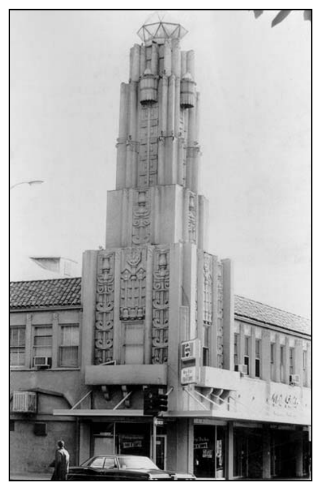
Chico's Senator Theater c. 1970 (Image Courtesy of: Special Collections Dept. Meriam Library, CSU, Chico).

*100 Best Art Towns in America by John Villani, 2005